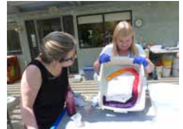
Sunset: Charmeuse Scarf