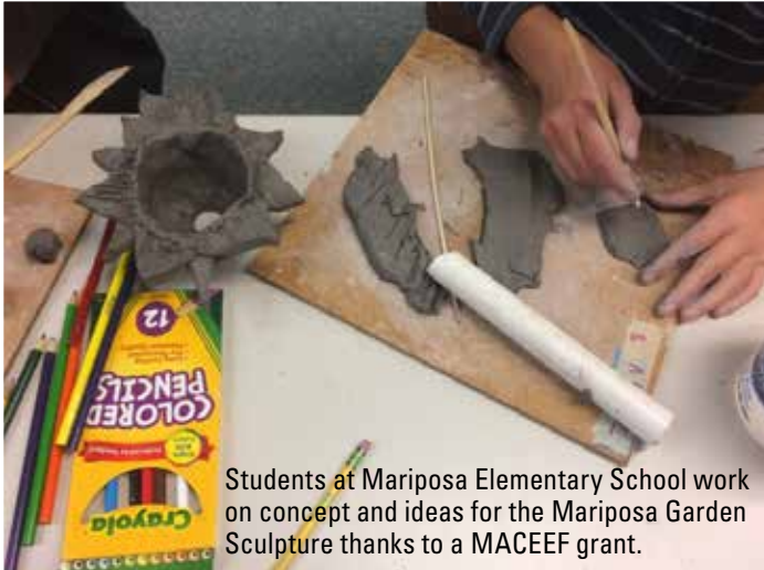
Students at Mariposa Elementary School work on concept and ideas for the Mariposa Garden Sculpture thanks to a MACEEF grant.