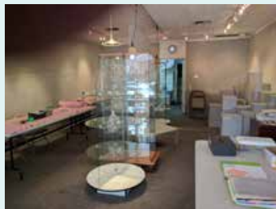
The gallery cleared and ready for the MMMS Take-In on Sunday 5th March

What worries the gallery coordinators is uncollected work, which is vulnerable to accidental damage. The RAA has no storage space for uncollected items and will not accept