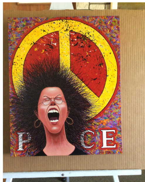
Screaming For Peace

falls into. For lack of a better term, I simply call them "artoons." Looking back it appears that my life, as an artist and cartoonist, has pretty much come full circle!