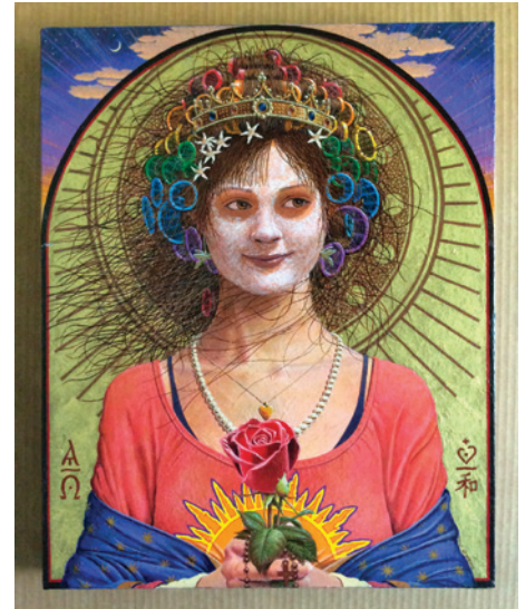
Our Lady of Eternal Optimism

About a dozen years ago, while browsing through my sketchbooks, I became aware of the many cartoon doodles that appeared alongside my drawings and renderings. It was at that point I began to mull over the idea of creating art pieces based on my cartooning concepts, but presented in a "fine art" format. I got excited! The pictures that I will display, during the program, are some of the results of that challenge to myself. I have no idea what category of art this work