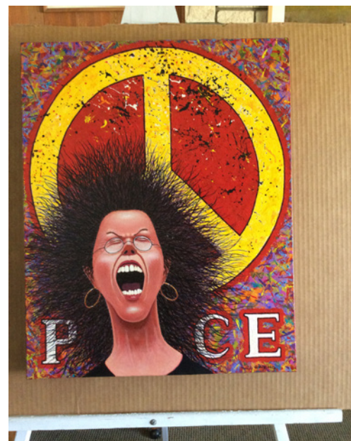
Screaming For Peace

falls into. For lack of a better term, I simply call them "artoons." Looking back it appears that my life, as an artist and cartoonist, has pretty much come full circle!