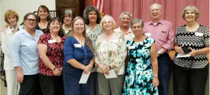
More photos on pages 7 and 8